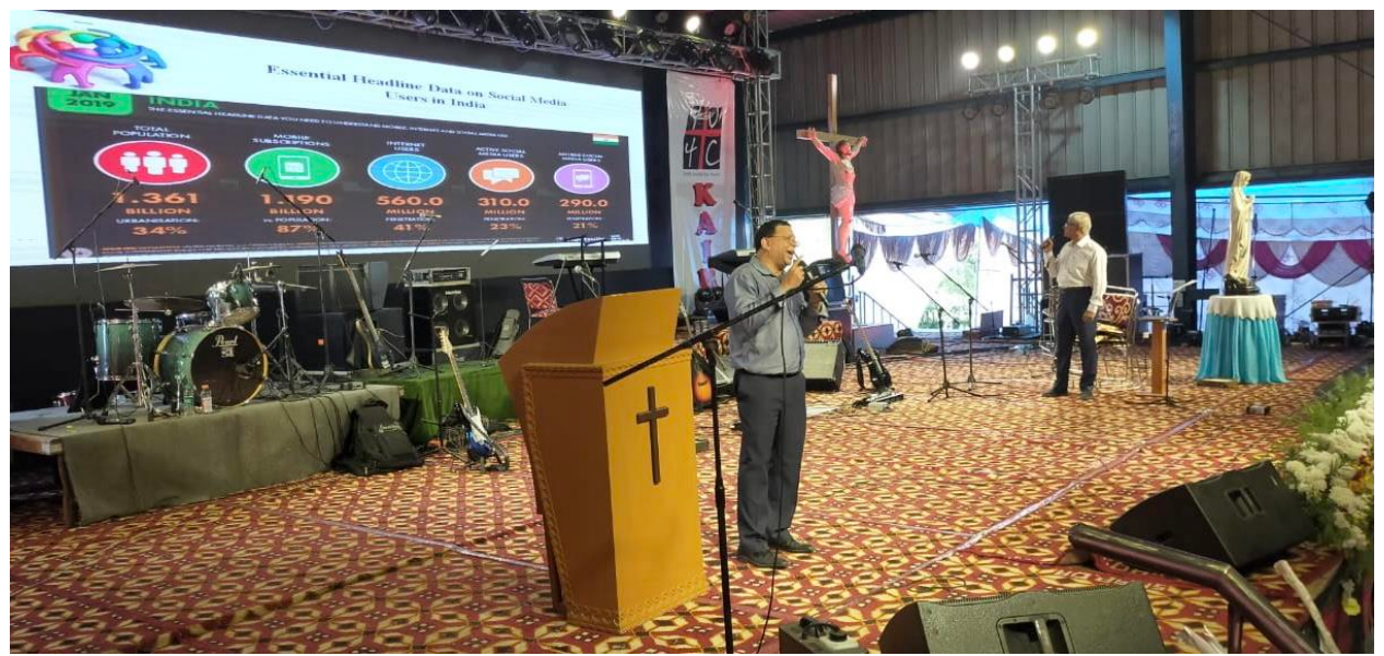
Hope for Youth President speaking at the National Catholic Youth Convention in Delhi