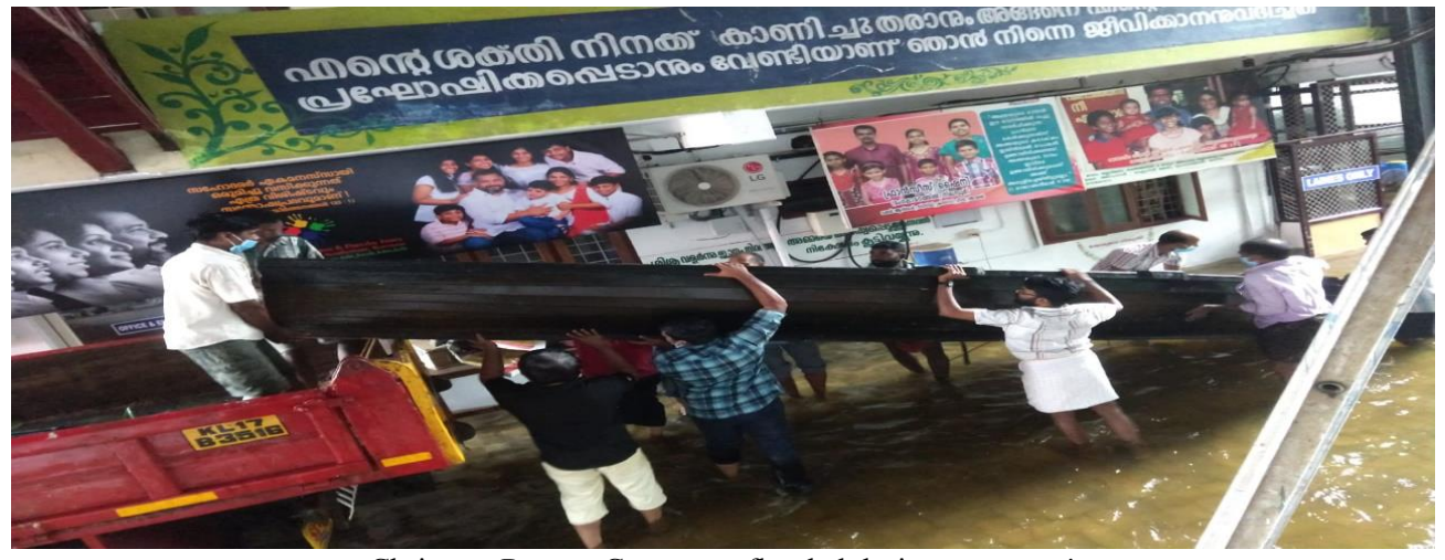
Christeen Retreat Center got flooded during monsoon!

In addition to the pandemic, Christeen was also struck with a serious damage to the facility built with the support of Hope for Youth. Literally, they needed to bring a small boat ( see below ) to move from one building to the other. By God's grace, the damage was not tragic. It refined our resolve and sharpened our faith.